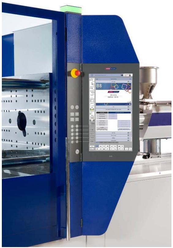
Fig. 1: The new UNILOG B8 control system – from the K 2016 onwards available for all PowerSeries machines